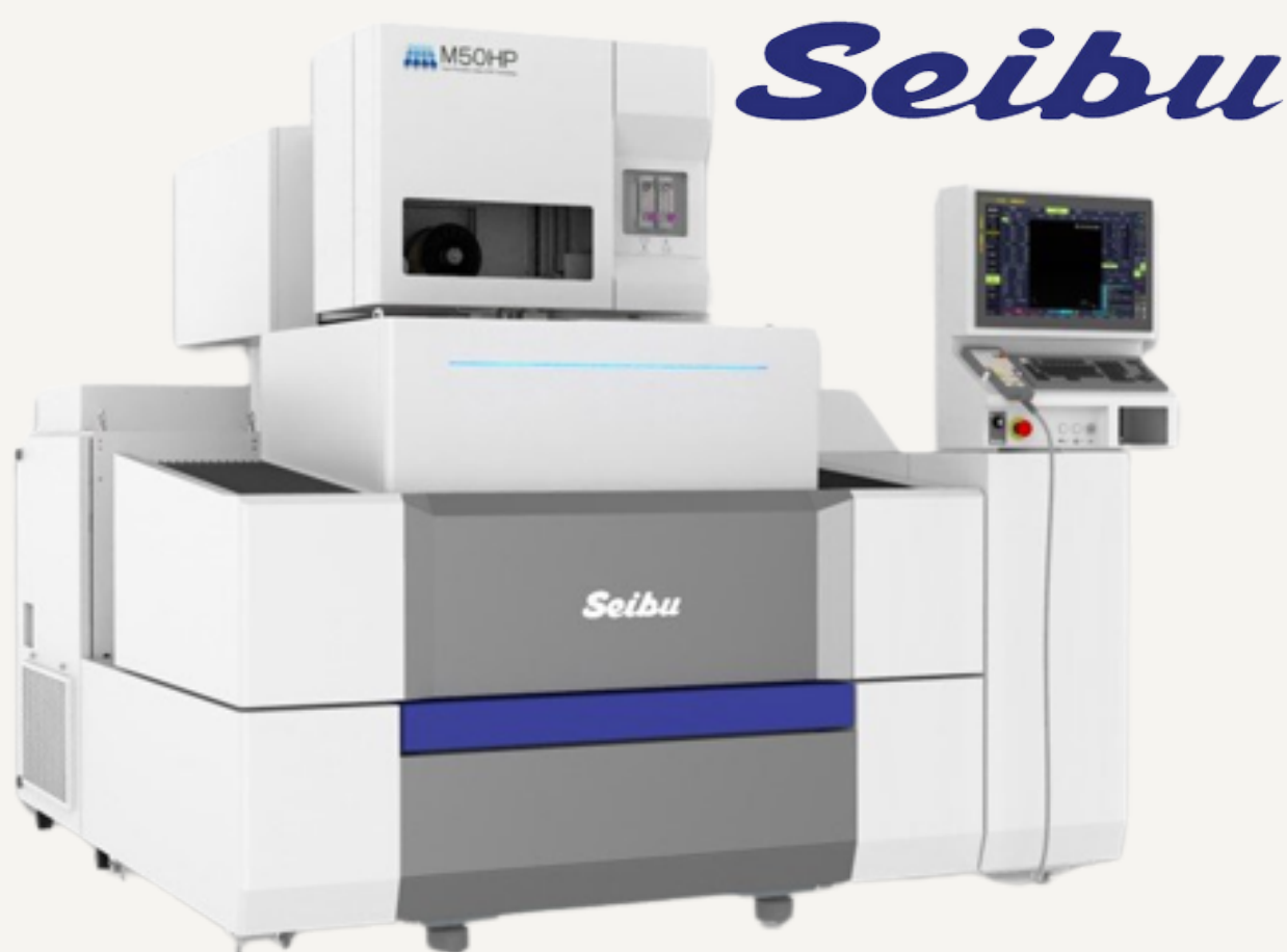
Precision Wire EDM Machine SEIBU M50HP

What You Can Find in Our Booth At Hall A3-300 :