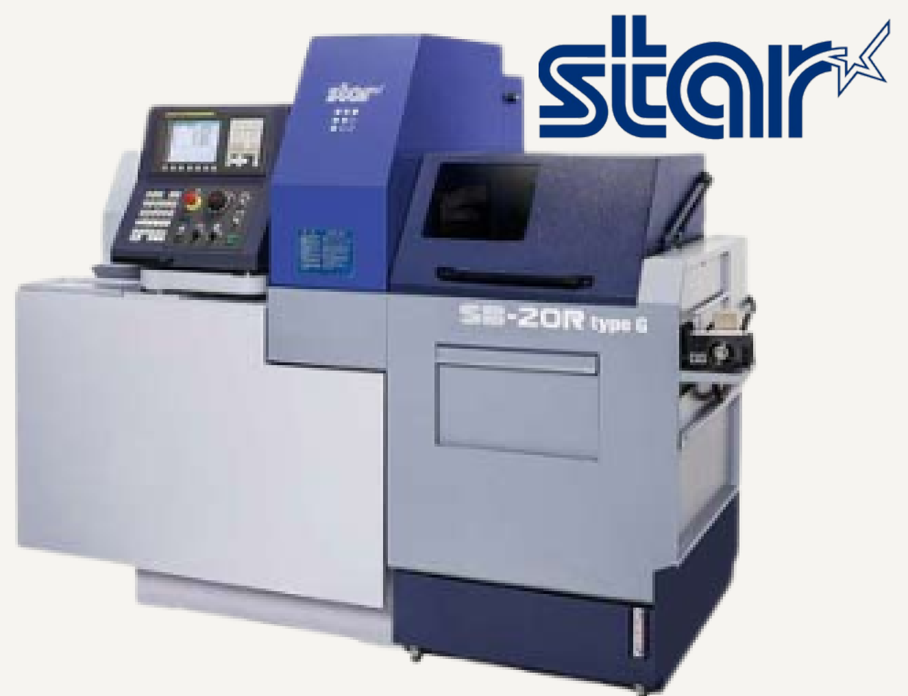
CNC Swiss Type Automatic Lathe STAR SB20R TYPE G

CAM-TOOL EXCESS-HYBRID II CAD - CAM SOFTWARE